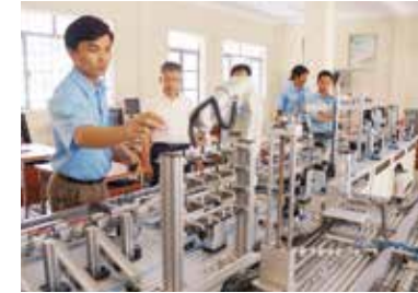
Dispatch of "JICA Manufacturing HRD Program in Dong Nai Province, Vietnam"

PREX dispatches theme-matched specialists in response to counterpart requests. Specialists then host seminars at the dispatched locations. Also, in collaboration with local governments in Kansai, JICA Partnership Program dispatches specialists and holds training/guidance seminars to complement these seminars in Japan.