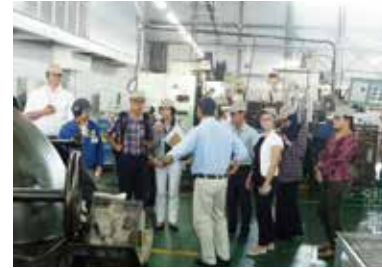
Company visit by participants of " JICA Managerial and Financial Support for Small and Medium Enterprises Development (A)"

Under commissions of Japan International Cooperation Agency (JICA) - responsible for Official Development Assistance (ODA) - as well as major economic organizations and overseas counterparts, we hold seminars on management and strategy, with a focus on industrial promotion. These include those on the topics of "Cooperate Management" , "Small and Medium sized Enterprises (SMEs)" , "Trade Promotion& Marketing" , "Environment Management" , and "Regional Industry Development & Tourism Development" .