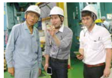
Company visit by participants of "PREX Manager Development Program for the Vietnamese Staff"

PREX also undertakes the development of human resource capacities and business exchange projects necessary for the global development of SMEs in Japan, based on our experience as a seminar-implementing organization targeting human resources in developing countries. PREX has been highly assessed by participants in its training program to develop on-site executives for Japanese companies which deployed operations in Viet Nam.